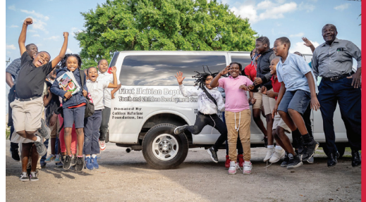
(Two photos are pre-Covid.)